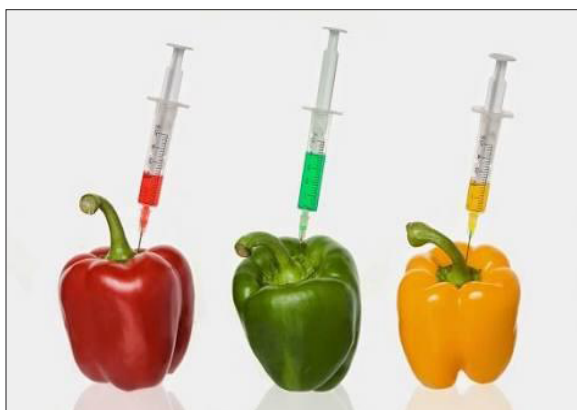
Figure 3. Genetically Modified Bell Pepper

are intrinsic arguments and extrinsic arguments. Intrinsic arguments against biotechnology maintain that biotechnology is “disagreeable in itself” whereas extrinsic argument focuses on “apparently harmful concerns of constructing GMO’s”. During this sense animal biotechnology is ethically challenging because it is unusual to genetically engineer foods, plants and animals. This argument drives like this biotechnology is the method of “restructuring an animal” that is the “playing with God”. Animal biotechnology may also disrupt down the species boundaries.