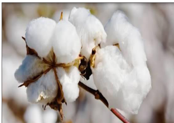
Figure 4. Bt-Cotton [Google]

Further there are negative impacts due to gene-splicing because it practices viral vectors to hold the efficient gene into the human body. The implications of those viral genes on the human body seem not to be known. The efficient genes may substitute the other genes besides the transformed genes. It may additionally cause totally different types of diseases to humans.