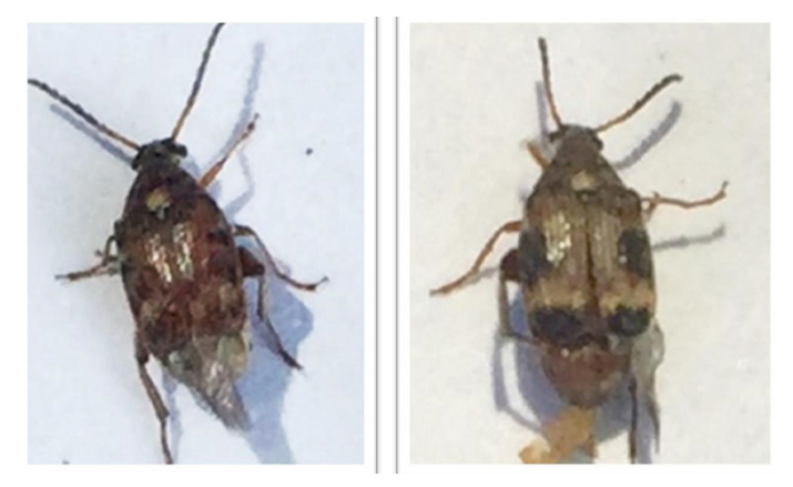
Plate 1: Male Callosobruchus maculatus F. Plate 2: Female Callosobruchus maculatus F.

Female cowpea seed bruchids isolated were distinguished from male seed bruchids by having an overall darker appearance in comparison to males which were brown in colour. The females had two characteristic large lateral dark patches midway along the elytra and smaller patches at the anterior and posterior ends while the males were much less distinctively marked. Also, the plate covering the end of the abdomen was larger in females with smaller patches while in the males, the plate was smaller and lacked patches as shown in Plates 1 and 2 respectively. The identification of the insect sexes was confirmed using electronic documentation of the organism including outlines from Orkin insect identification chart.