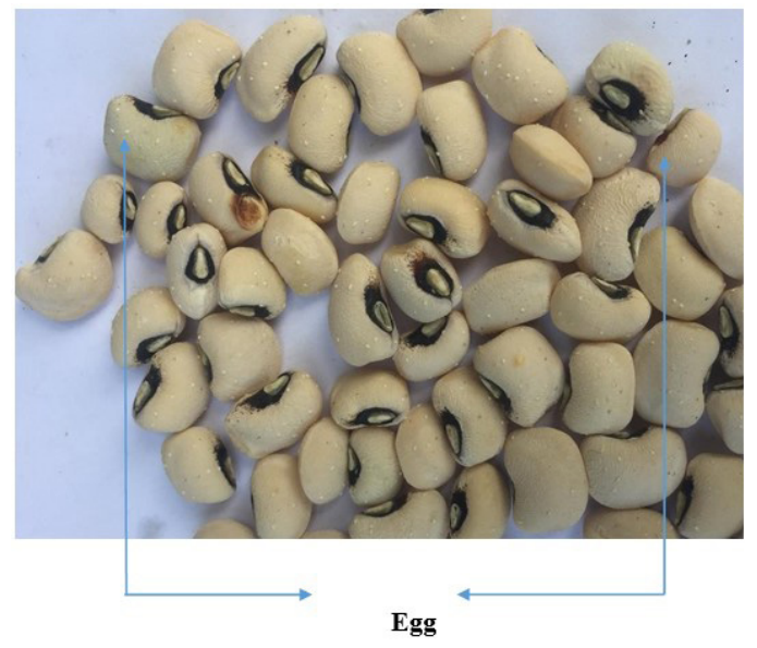
Plate 3: Eggs of Callosobruchus maculatus F. on Cowpea seeds

The seed bruchid eggs became visible on cowpea seeds 3-4days after the adult male and female were introduced into the cowpea seeds as shown in Plate 3. The eggs were small, grey and dome-shaped with flat bases and were cemented to the surface of the seeds. Emerged progenies were visible 23-24 days after eggs were seen (Plate 4).